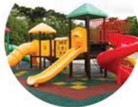
Kids' Play Area