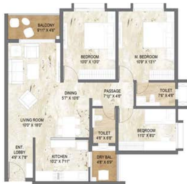
Unit Plan - 2.5 BHK