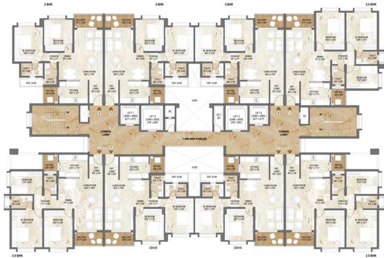
Typical Floor Plan - A BLDG