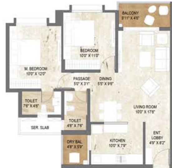
Unit Plan - 2 BHK