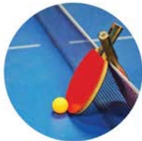
Indoor Gaming Zone