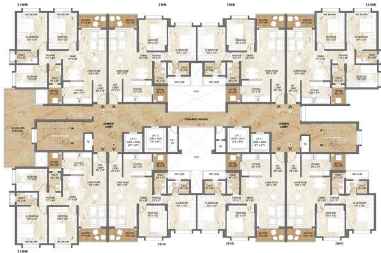
Refuge Floor Plan - B BLDG